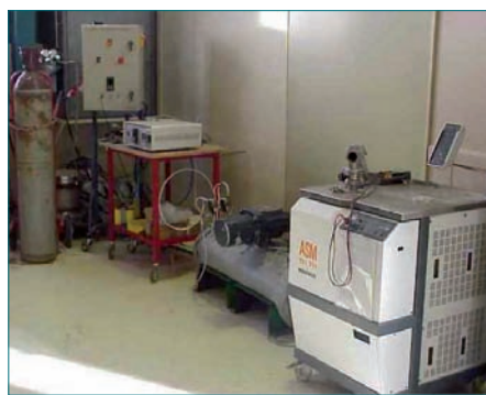
Fig. 1: The CETIM (France) valves fugitive emissions test bench.

A need for a global standard on fugitive emissions was clearly appearing. A work item was then proposed to the ISO TC 153 SC1 to develop a type test standard. The valves stem sealing techniques and testing are the same for on-off and control valves, therefore it was proposed to include in the same standard the control as well as the on-off valves. All specific requirements were discussed and agreed by the IEC SC 65B WG9 (the body writing the control valve standards) and at least one person was member of both working groups to ensure consistency. In parallel the French valve association and the Cetim developed a test bench to ensure that the type test according to the